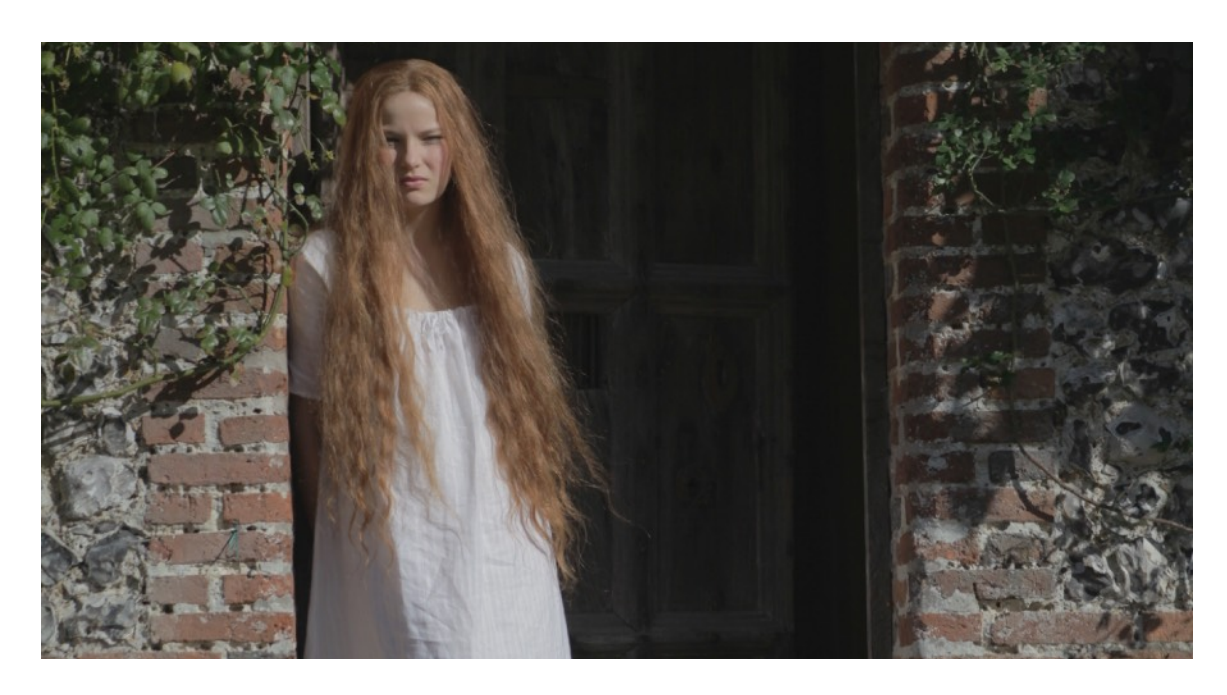
HEADING TO PLUMPTON

In September 2017, the production decamped to the Plumpton Place in East Sussex, a Grade II listed Elizabethan manor house that would form the base for the shoot. Not only providing the film's main location, it would also serve as both accommodation for some crew members and even a rehearsal space. Harris was particularly keen on spending time with her cast rehearsing before the shoot began. "I think it's invaluable. I think it would be terrifying to show up on set without that."