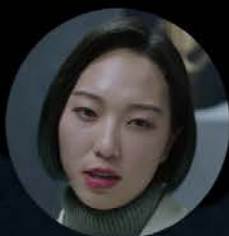
KIM Hannah / Jina's boss

A guy who often smokes in the apartment hallway. His body is found a few days after he dies alone in his home.