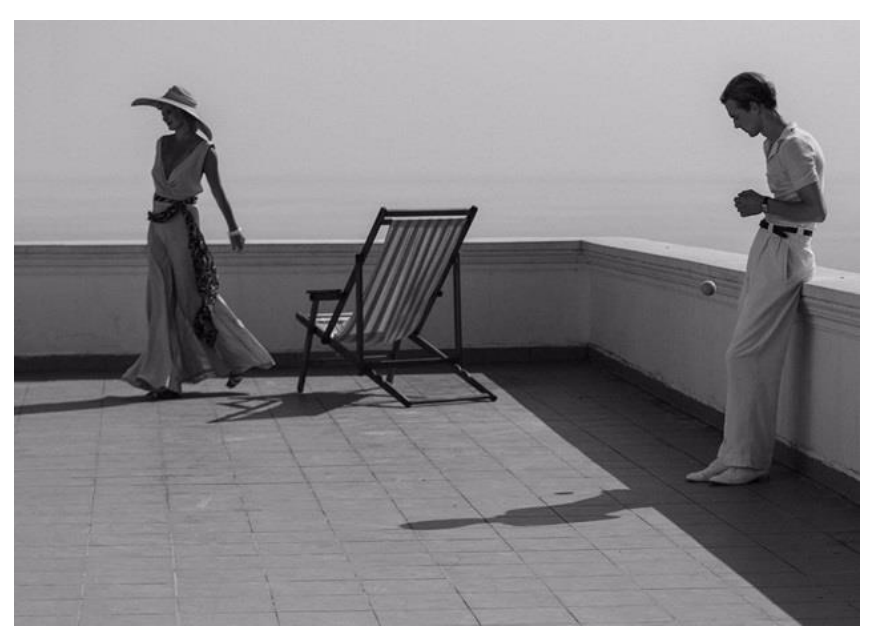
Russia, Germany / 2016 / Drama / Russian, German, French and Yiddish with English Subtitles 132 min / 2.40: 1 / 5.1 and 2.0

"A somber and ambitious tale of love and loss set during Europe's most hellish mid-century days." - Neil Young, The Hollywood Reporter